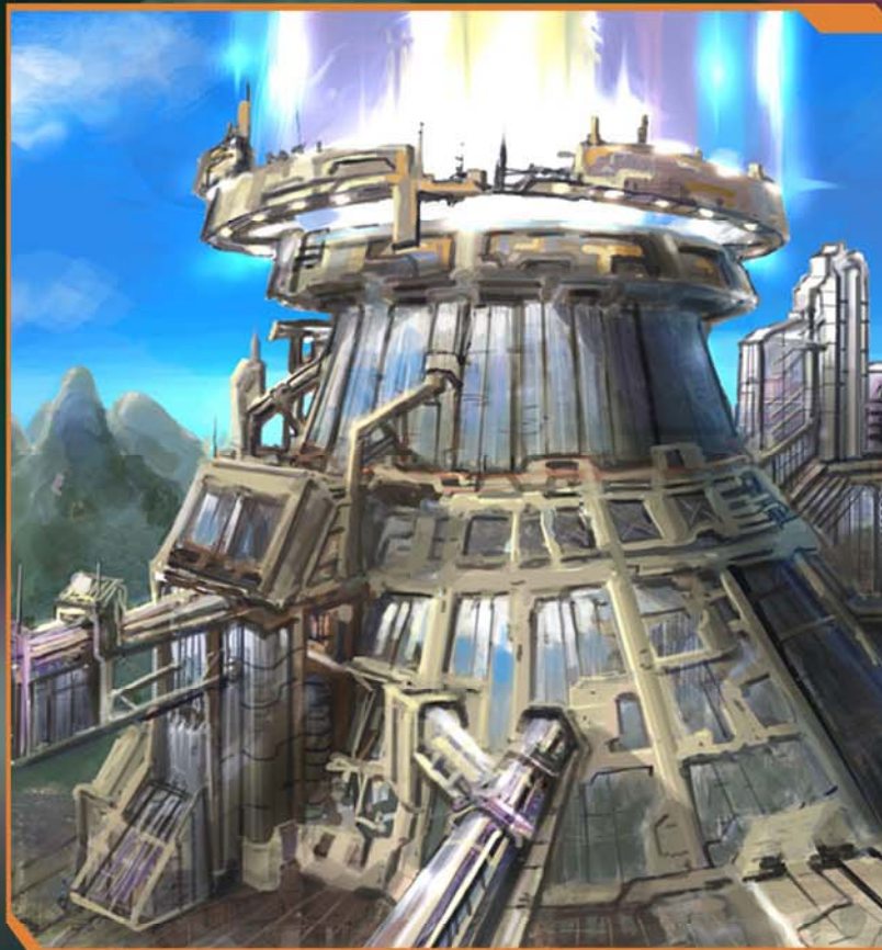
Artist's impression of an Earth-based Transporter Ring

Project 'Reclamation' will see Feer set foot on Earth for the very first time.