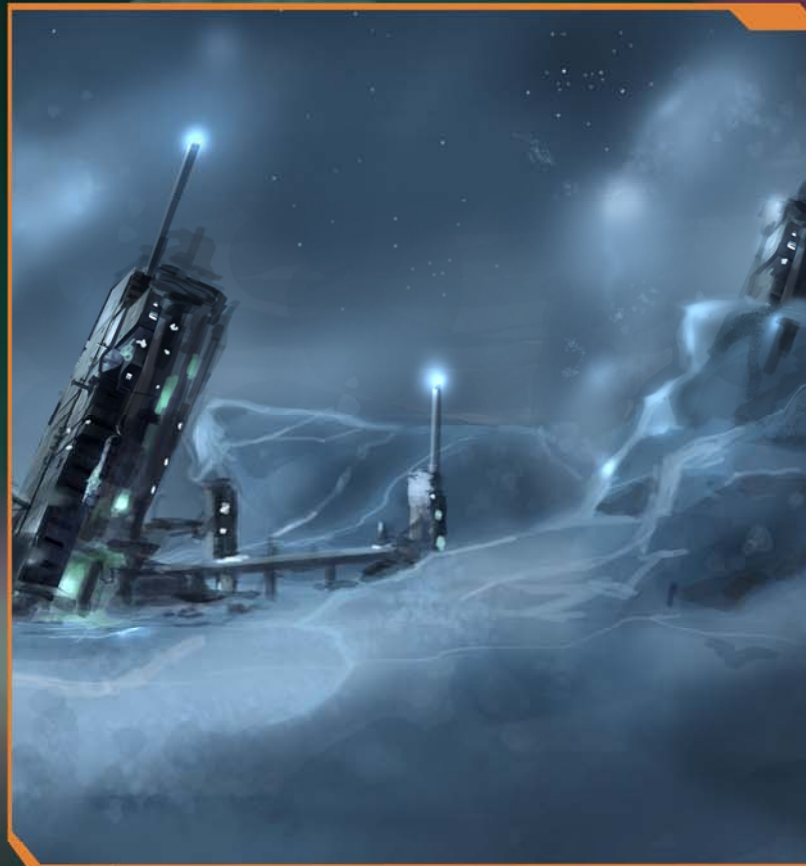
Artist's impression of the Frozen Hemisphere, New Earth

On the back of the population crisis, the planet is plunged in to a new crisis with seemingly endless streams of giant earthquakes, causing many millions of deaths amidst widespread devastation. Many cities are left in ruins; beyond repair