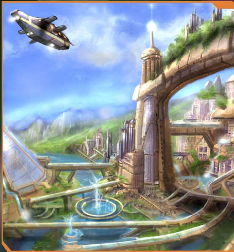
Artist's impression of New Havana, Emerald Ring

2074 Things change when Feer loses his only close friend to the war – anger replaces indifference