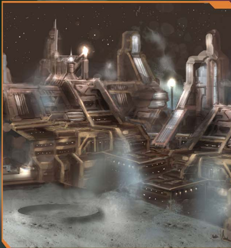
Artist's impression of a Dominion lunar mining colony

The seventies sees Dominion's empire on new Earth take on an altogether grander proportion. The Rapid Aero Tube system (RAT) connects all cities of the Emerald Ring to all Solar Farms stationed in the scorched hemisphere of